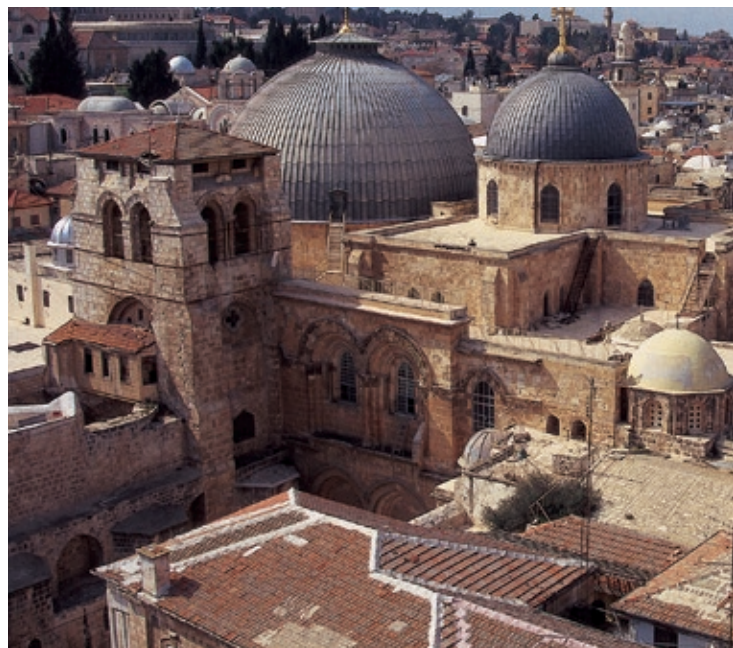
The domed roof of the Church of the Holy Sepulcher, Jerusalem.

When God told Moses that He was to bring His people out of Egypt into Canaan, He described it as "a rich and spacious land, a land flowing with milk and honey" (Exodus 3:8). Similarly, when Moses sent spies to explore the land, they confirmed this description: "The land we passed through and explored is excellent . . . a land flowing with milk and honey" (Numbers 14:7-8). They showed concrete evidence of