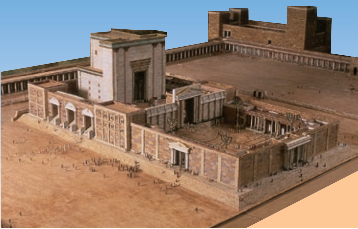
Model of Herod's temple. Jesus' parents found Him in the temple court, debating with the Jewish rabbis.